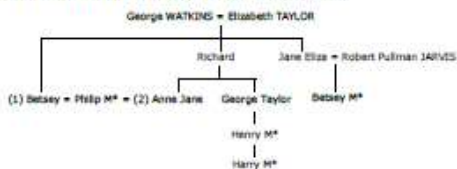
Figure 2: An example of M a surmids honouring a male relation by marriage

In 18 cases, I traced the surnames of all four grandparents and found that none of them was an M a . I had already found cases where a surmid had skipped a generation (see above), but none where it had skipped two generations. I was therefore confident that these were honorific surmids.